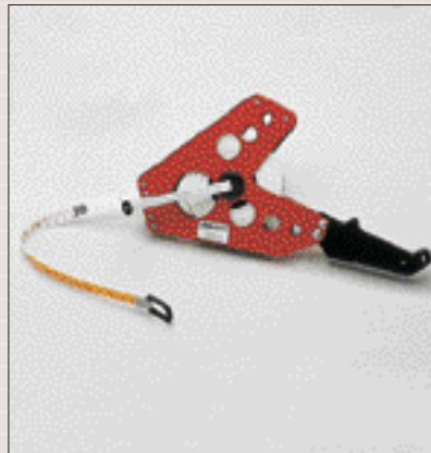
Synthetic measuring tape

Eijkelkamp Agrisearch Equipment can supply more optional items from the broad range of hand augers, core samplers, balances, sieves and surveying equipment.