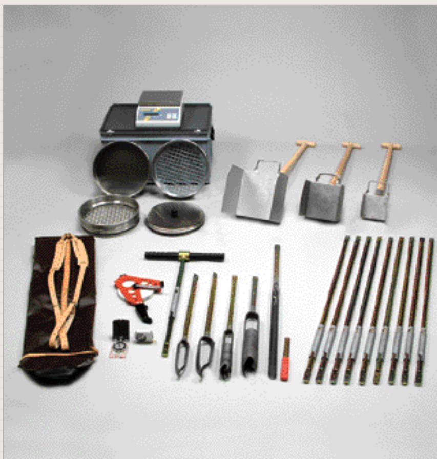
Set for the Building Materials Decree