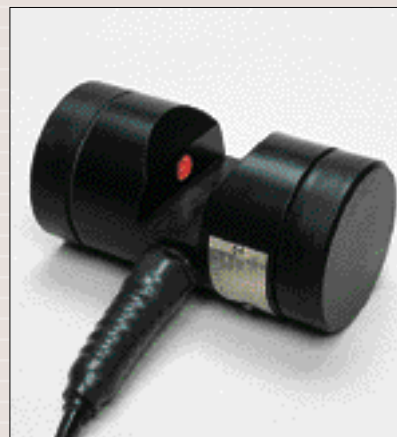
Probe with lightsource and sensor