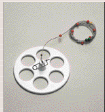
Visibility disc according to Secchi