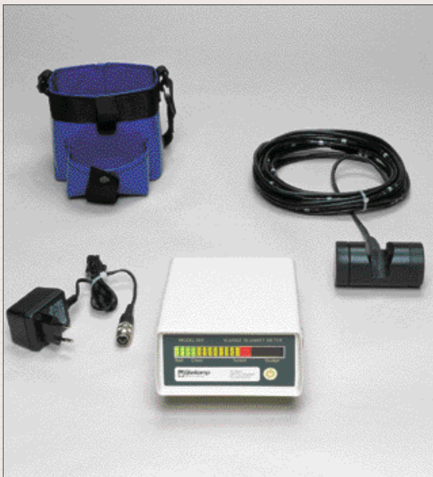
Sludge blanket detector with sensor, battery charger and carry holster