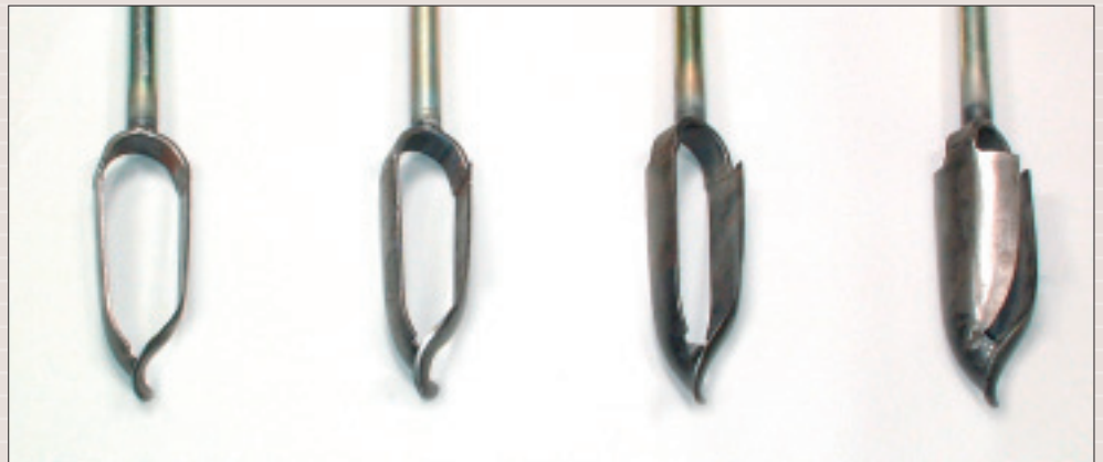
Edelman augers: clay, combination, sand and coarse sand type

For soils with a large gravel content. The auger body for stony soils consists of a heavy steel strip, vaulted all along, which is bent double by forging. The pointed cutting bits of the strip are bent outward, thus creating a hole some-what wider than the average body diameter. The stony soil auger is used when the Riverside auger is not yielding adequate results in coarse gravel soils.