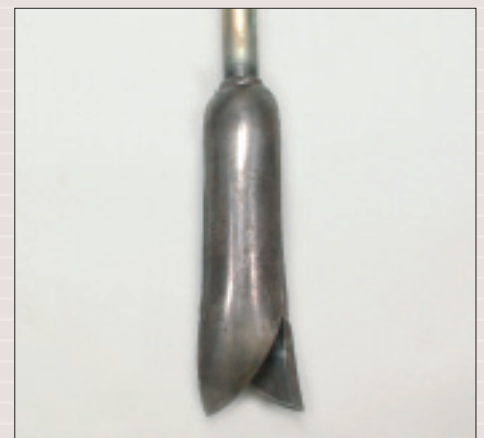
Stony soil auger