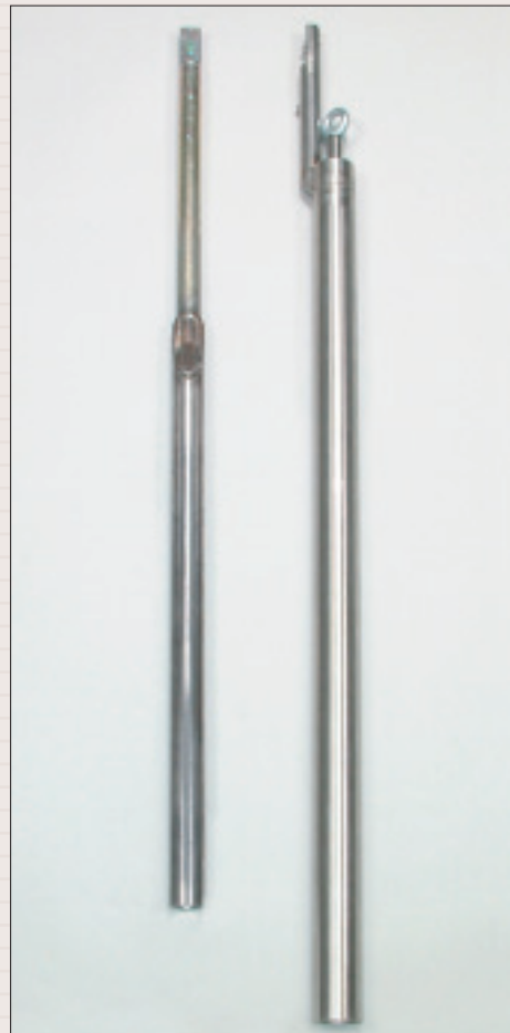
Gouge auger and piston sampler

The gouge auger with the smallest diameter is used for the deepest sample.