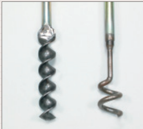
Spiral auger and stone catcher

This special type of Edelman auger has an extended auger body (sensitive to torsion) and is suitable only for sampling very soft (clay) soils.