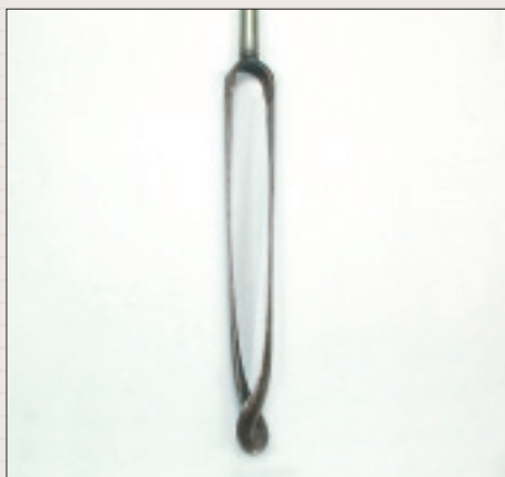
Soft soil auger