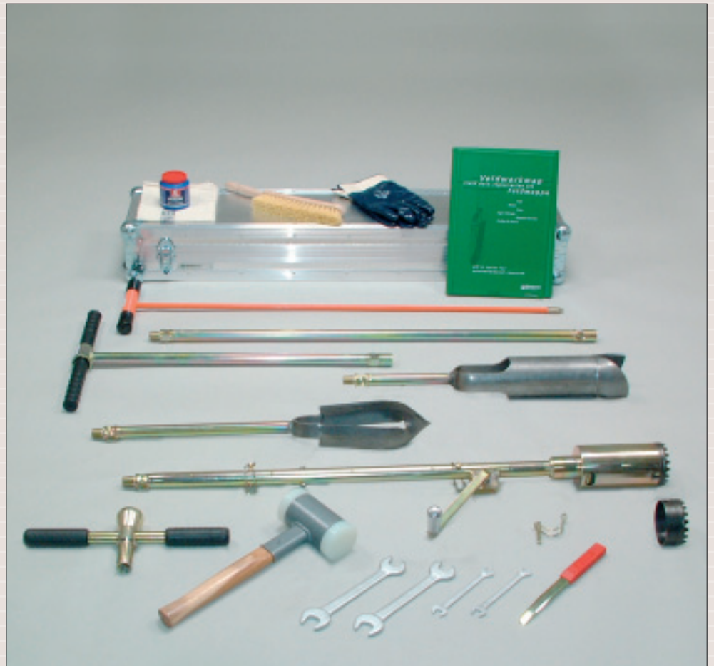
Bi-partite root auger set

By applying the bi-partite root auger almost undisturbed, uniform soil samples can be taken in layers of maximal 15 cm. The bi-partite root auger consists of a bottom part fitted with an exchangeable drilling-crown and a short unscrewable top part (handle) with a beating head.