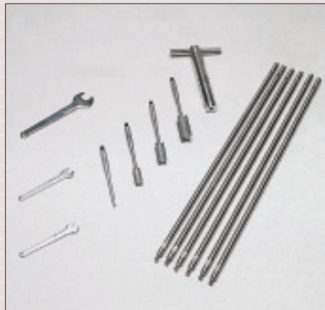
Field inspection vane tester set

The standard set contains, among other items: a field inspection vane tester, complete with three vanes (16 x 32, 20 x 40 and 25.4 x 50.8 mm) and a dummy vane, various extension rods, spanners and a solid carrying bag.