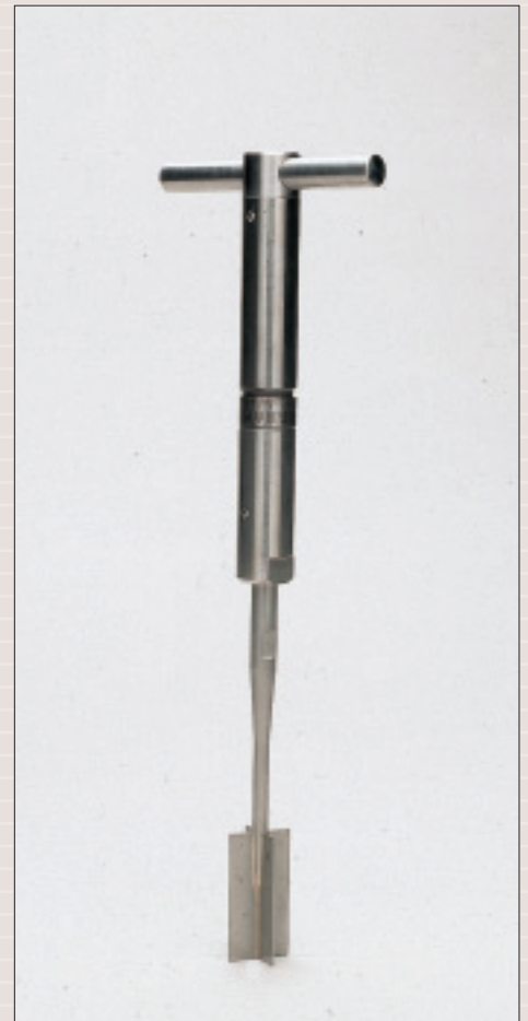
Field inspection vane tester