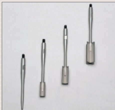
Three vanes and a dummy vane