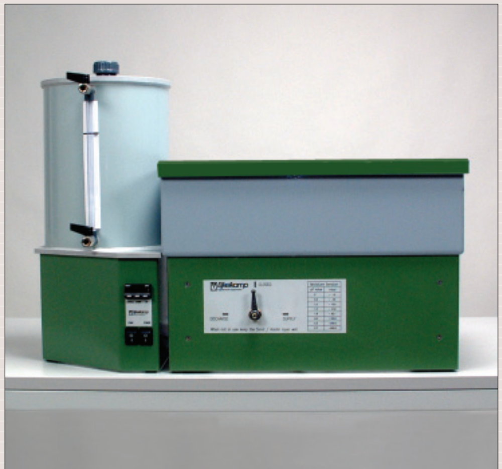
Sand/kaolinbox for pF-determination (pF 2.0 - 2.7)