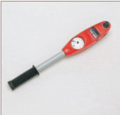
Measuring body robust vane tester

The standard set contains, among other items: the measuring body, two vanes (60x120 mm and 75.8x151.5 mm), various extension rods, spanners, accessories and a carrying case. Optionally available is an extractor.