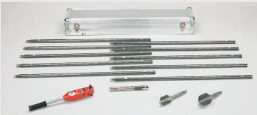
Field inspection vane borer set