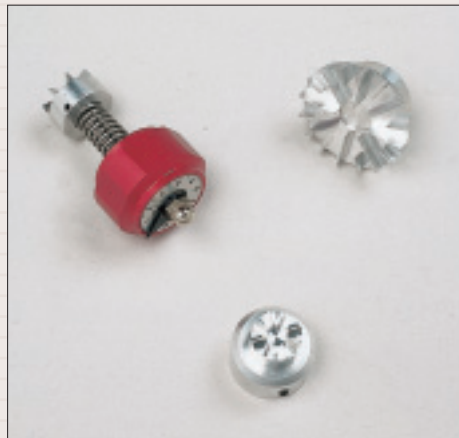
Pocket vane tester

The pocket vane tester is supplied inclusive of note pad, carrying bag and 3 vanes with a measuring range of respectively 0 - 0.2 / 0 - 1 and 0 - 2.5 kg/cm 2 .