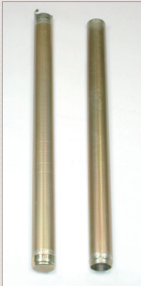
Extendable filter (for 09.01.SB)

The complete standard set, for measurement up to a depth of 75 cm, fits in a carrying bag and, among other items, contains: the Guelph permeameter, a tripod, drill bits, a vacuumtest manual pump, a fold-up jerry can and various accessories.