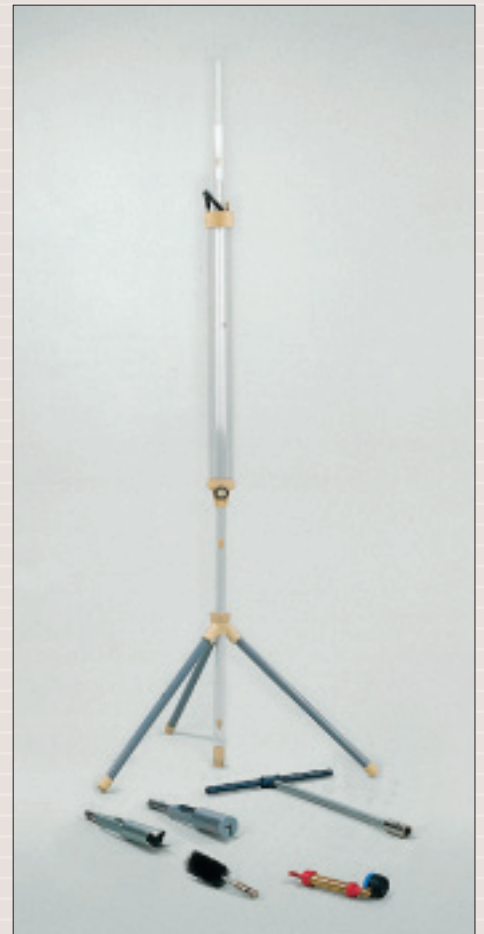
Guelph constant head permeameter