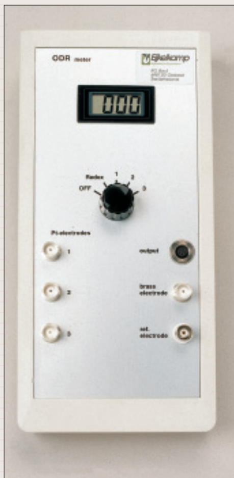
Oxygen diffusion meter