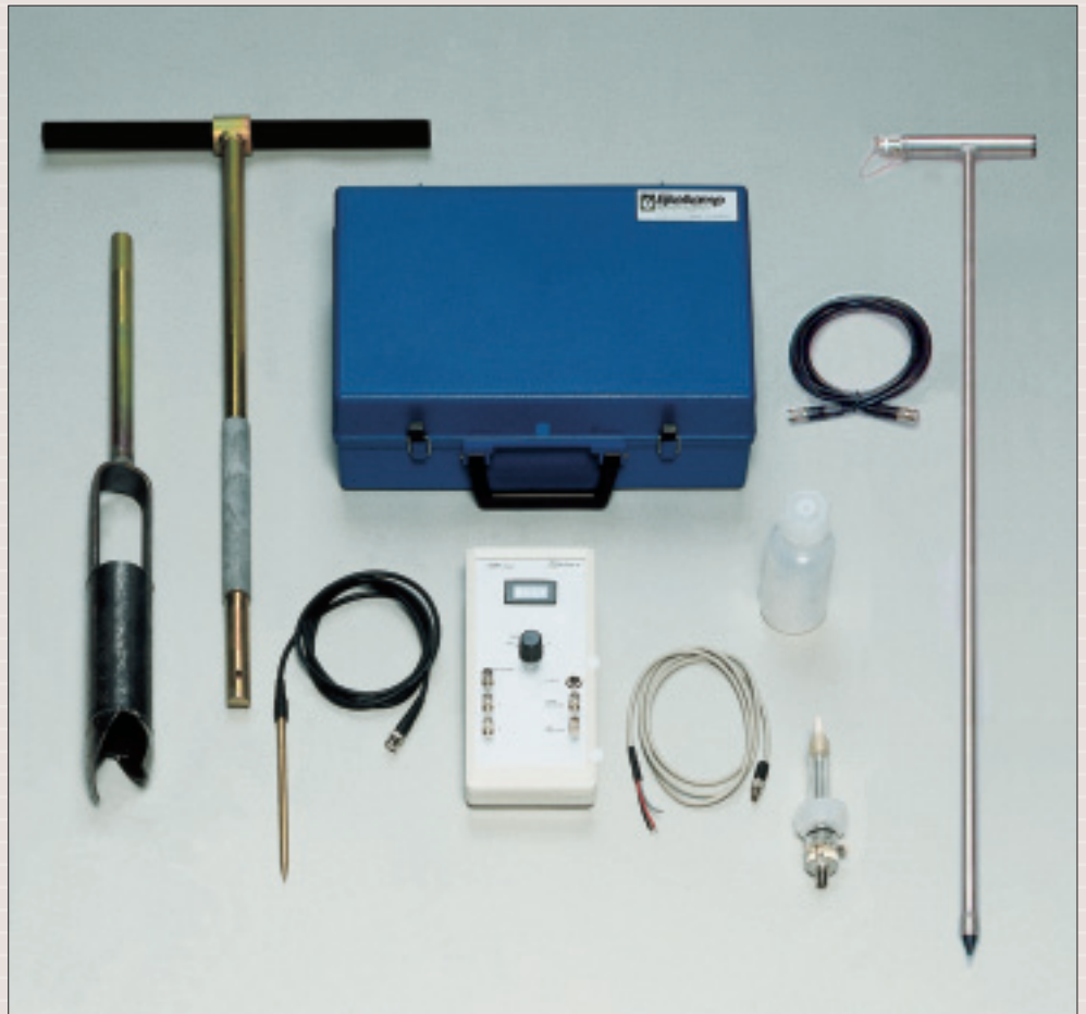
Oxygen diffusion measurement system

Plants need air as well as water, a permanent heterogeneous pore system thus is an essential requirement. Such a pore system is enhanced by the following: activation of soil life; drainage and tillage. The process of aeration is hindered by: soil compaction; the soil being too wet; soaking; paving and adding material.