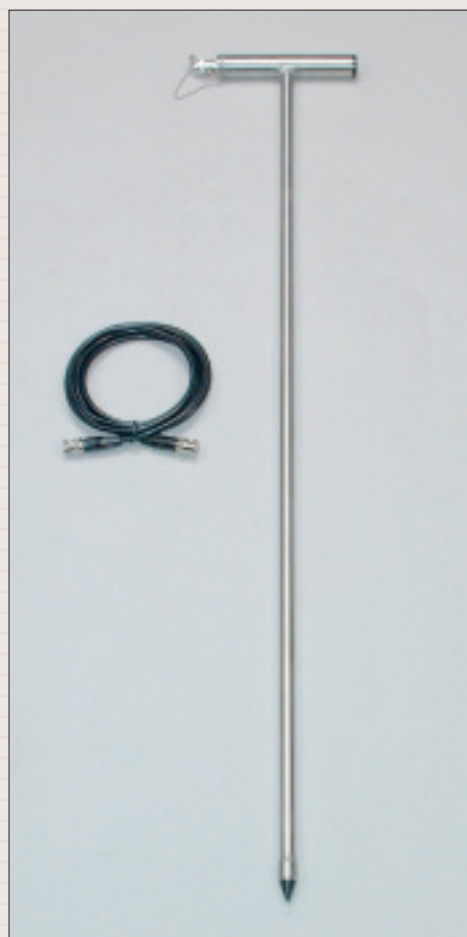
Oxygen diffusion probe