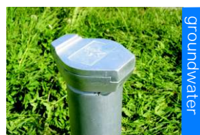
Top Piece - closed