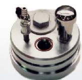
Top Piece for Artesian Wells