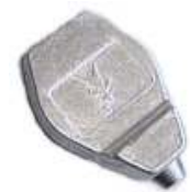
SEBA Top Piece (Standard)