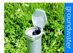
Open Top Piece with installed Data Logger