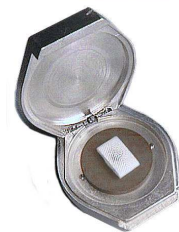
Flood Tight Top Piece