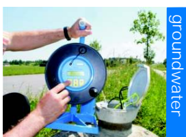
Control Measurement with Multiparameter Probe