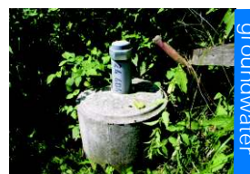
Top Piece with GSM antenna