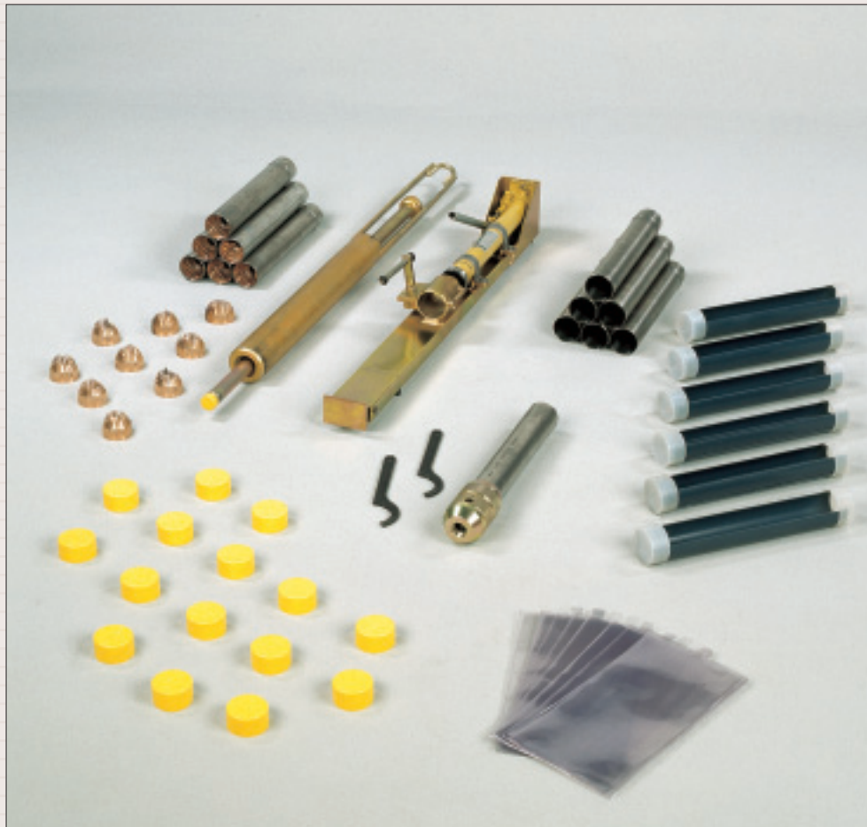
Akkerman core sampler set