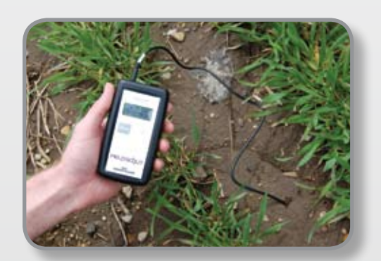
FieldScout Soil Sensor Reader connected to a buried WaterScout SM 100 Soil Moisture Sensor.