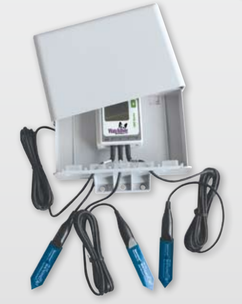
WatchDog 1000 Series Soil Moisture Micro Station shown with three WaterScout SM 100 Soil Moisture Sensors.