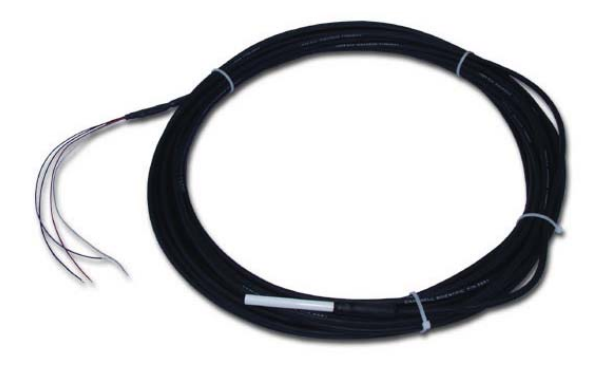
The 109 was developed specifically for the CR200(X)-series dataloggers. This probe outputs a signal of 0 to 2.2 volts.

41303-5A 6-Plate Gill Radiation Shield that houses a 109 for air temperature measurements.