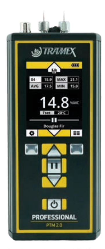
Product order code: PTM2

The Professional PTM 2.0 is a hand-held, digital, pin-type resistance moisture meter designed to take precise measurements of moisture content in wood, relative drywall readings and comparative WME (Wood Moisture Equivalent) readings in wood by-products and other building products. The Professional PTM 2.0 has built-in standard calibrations, specific calibration for over 500 wood species and adjustable temperature correction.